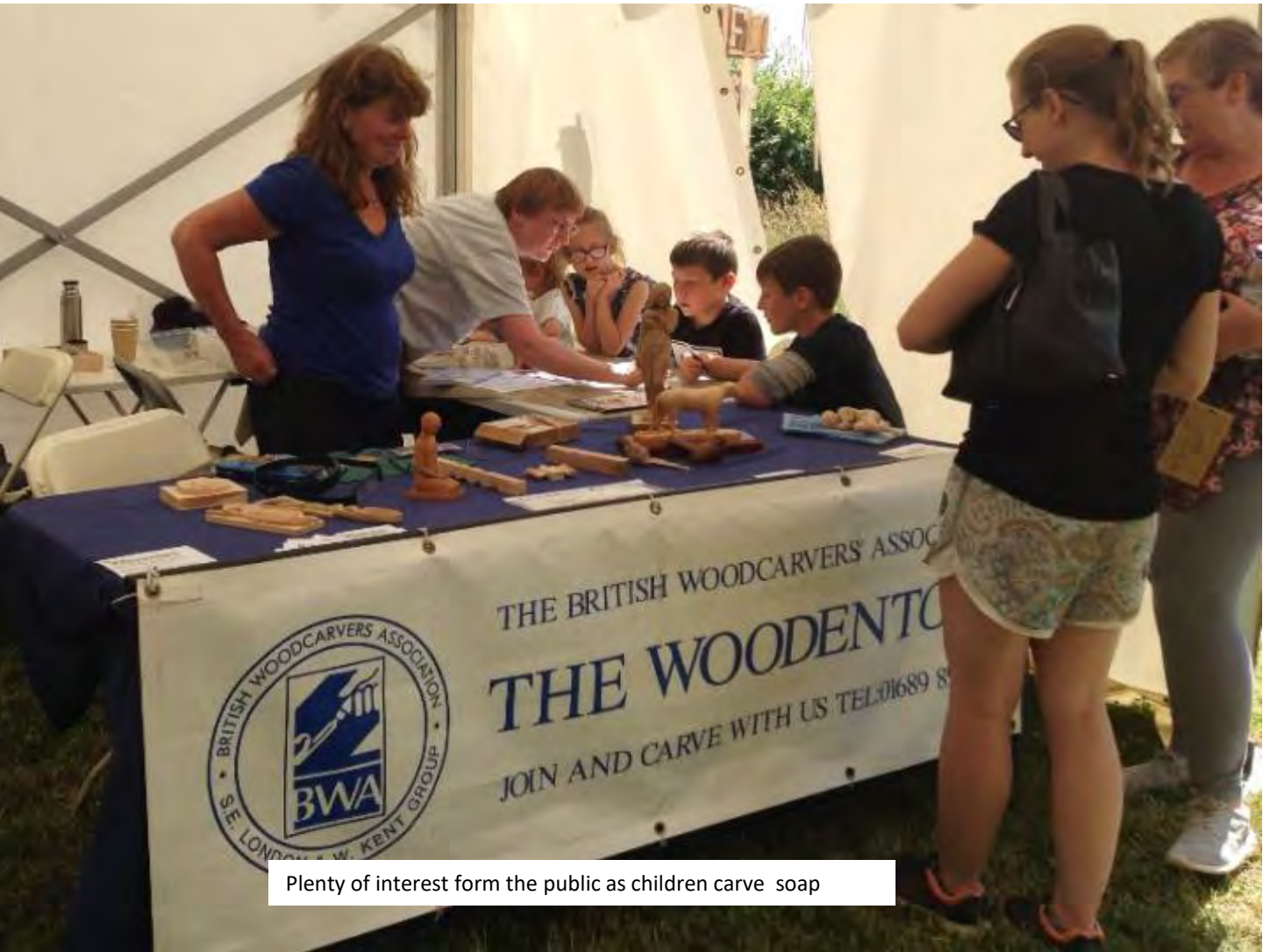
Plenty of interest from the public as children carve soap