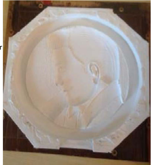
A plaster cast is taken