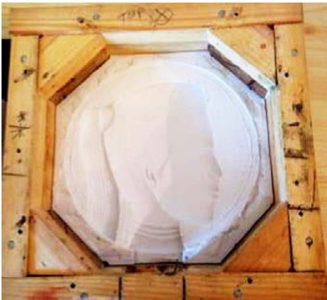
From a plaster cast, a new simulated metal image is cast. Special setting plastics, sometimes with metal filings in them, are used.