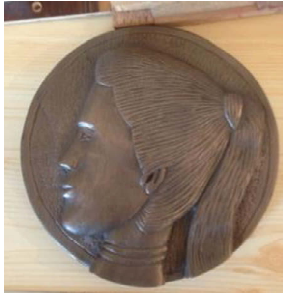
The new, 'bronze' image