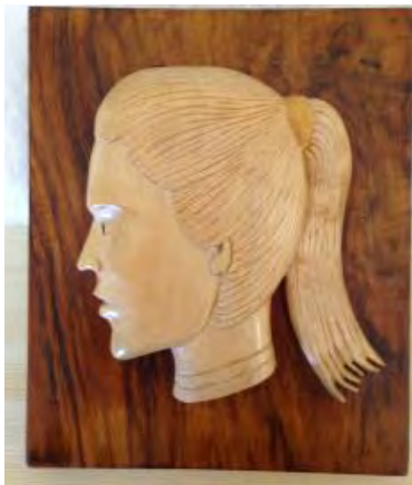
The original carving - a relief of a girl's head in one wood, set in a figured wood background

These shots of Laurie's expert casting skills show how one carving can lead to many – and with several different effects. The options are endless! Ask Laurie for more details.