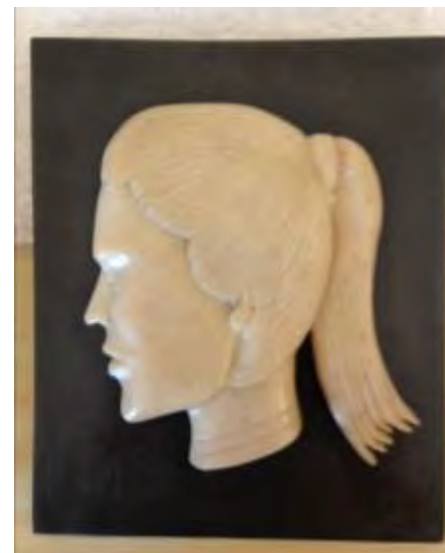
A second casting; this time an alabaster-type finish on a black resin background.