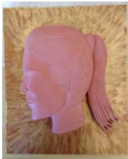
One casting; a coloured resin set in a background which is decorated in a flair pattern