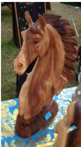
Out and about: an elegant horse's head and a wicker Beetle (well OK, this ones not actually carved but it's a nice piece of work) spotted at a local fete