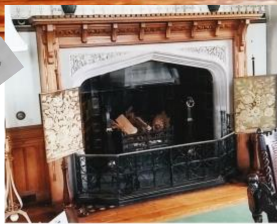
Upper Drawing Room