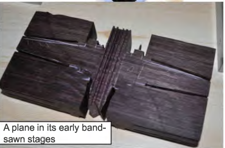
A plane in its early band-sawn stages