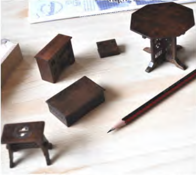
The pencil shows the scale she is working to!

We are very lucky to have two new talented members joining us. The first is Anne, who makes miniature furniture. The scale and detail in her work are incredible. Here are some examples of her work