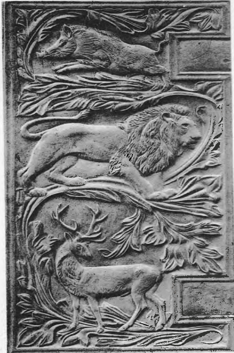
III.—Book Cover Carved in English Oak—"Tale of Troy." (only carved portion shown.)