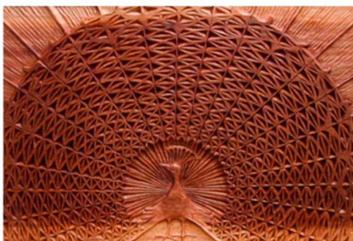
Peacock, 2012 Sapele - POA