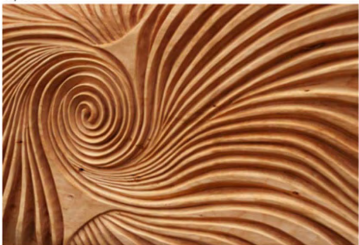
Whorl, 2010 Lime - Private Collection, Wiltshire