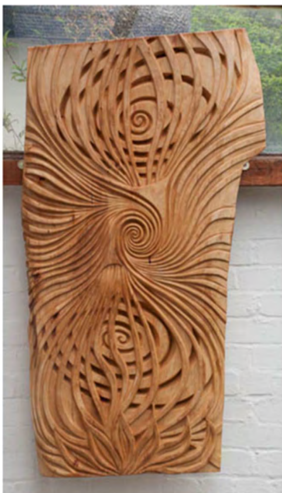
Abadiânia Entities Lime - private collection, Devon