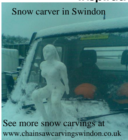
Snow carver in Swindon

Here's hoping all members had a great Christmas and New Year. The snow may have stopped us getting around, but it can give inspiration for carvers..