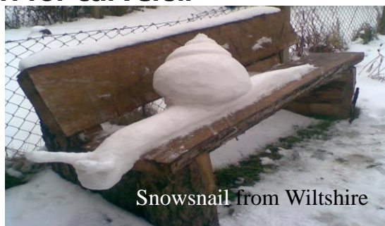
Snowsnail from Wiltshire

See more snow carvings at www.chainsawcarvingswindon.co.uk