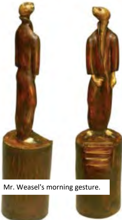
Mr. Weasel's morning gesture.