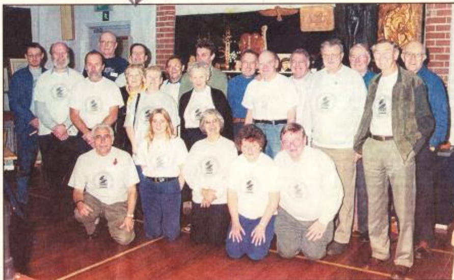
SPLINTER GROUP: The talented woodcarvers.

Among those who have contributed to the appeal fund are a group of expert wood-