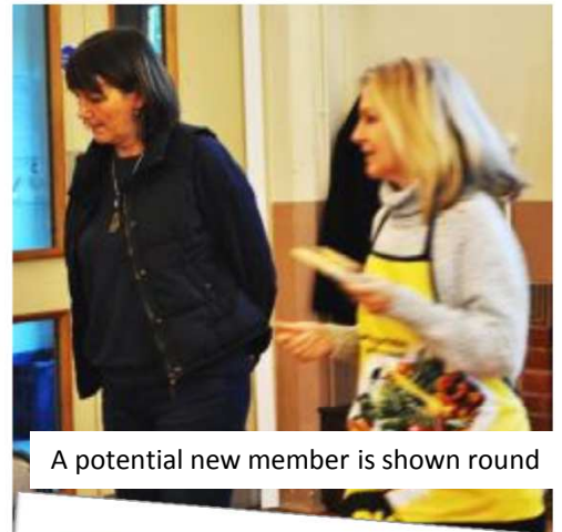
A potential new member is shown round