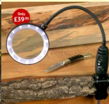
Magnifying Glass with Ultra Bright LED Light

There's more about the Princes' Trust at https://www.princes-trust.org.uk/help-for-young-people