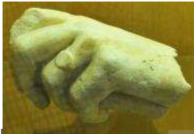
Hand compete with signet ring. It's 3000 years old, but looks so modern

We don't know if the Etruscans produced anything in wood – plainly all such items would have decayed to nothing by now, but there are plenty of examples of their marvellous art in other media, in the British Museum and in Italy. Here are some examples from the tiny town of Fiesole, near Florence, in the archaeological museum there (well worth a visit!). Apart from the relief sculptures, these are all tiny pieces only an inch or two high – perhaps they could provide you with inspiration for your next carving. And these were produced well before the birth of Christ – about 800 BC!