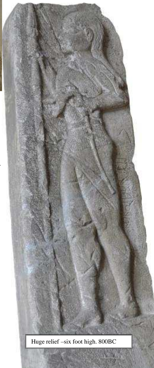
Huge relief –six foot high. 800BC