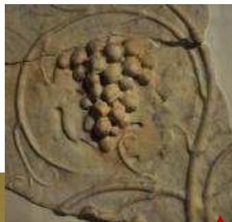
Grapes in marble, high relief