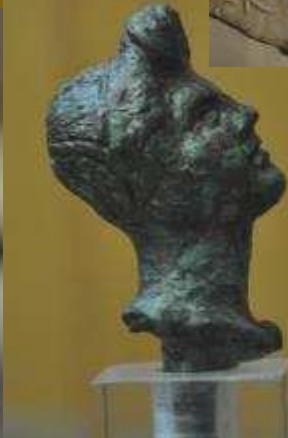
Three inch high head, beautifully proportioned, And such a hairstyle!