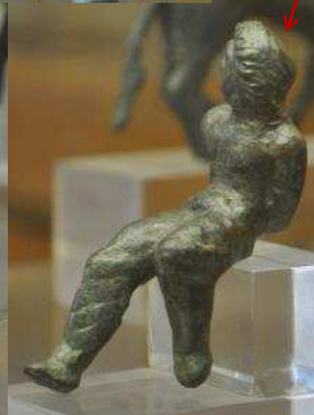
Three inch high man. My favourite –this little man has such a sense of shape and movement