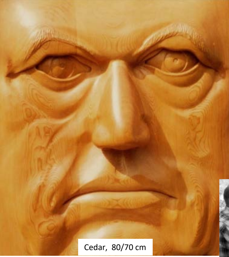
Cedar, 80/70 cm